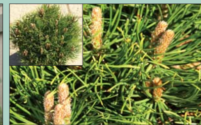
Dwarf Mugho Pine