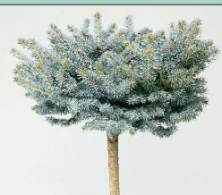
Globe Blue Spruce Standard