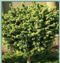
Little Gem Dwarf Spruce Standard