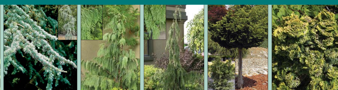
Weeping Blue Atlas Cedar Select Weeping False Cypress Weeping Nootka False Cypress Dwarf Hinoki False Cypress & Std. Golden Dwarf Hinoki False Cypress

Evergreens give structure and definition to a garden retaining their form and foliage through the seasons, most notably in winter when other plant varieties have long lost their leaves. A specialty of Mori Nurseries, our fine evergreen selections are only limited by your imagination. From shaped or topiary, narrowleaf or broadleaf, weeping, conical or low spreading, green, gold or blue, the selection is indeed endless.