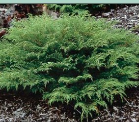
Northern Pride Microbiota