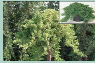
Two forms of Dwarf Japanese Garden Juniper