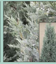
Blue Haven Juniper