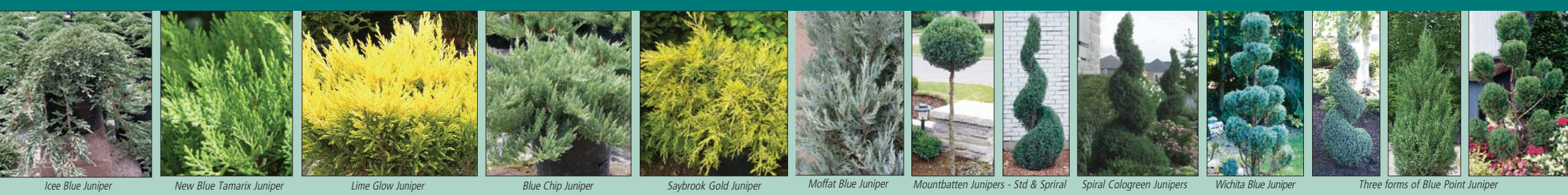
Icee Blue Juniper