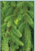
Weeping Norway Spruce