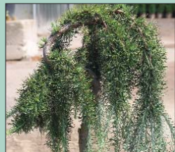
Weeping European Larch