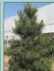
Eastern White Pine