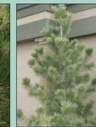
Vanderwolf Pyramidal Pine