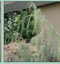
Tolleson's Blue Weeping Juniper