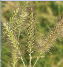
097-69 Pennisetum 'Hameln'