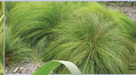
098-15 Sporobolus heterolepis