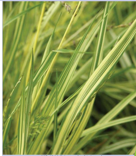
097-48 Molinia caerulea 'Variegata'