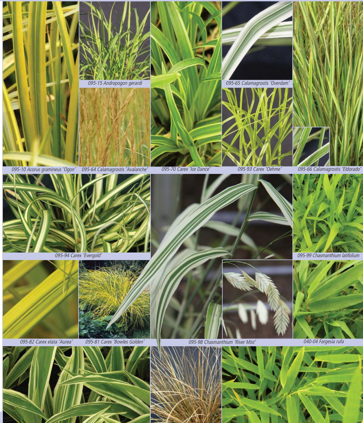
095-10 Acorus gramineus 'Ogon' 095-64 Calamagrostis 'Avalanche' 095-70 Carex 'Ice Dance' 095-65 Calamagrostis 'Overdam' 095-66 Calamagrostis 'Eldorado'