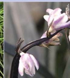
097-52 Ophiopogon 'Nigrescens'