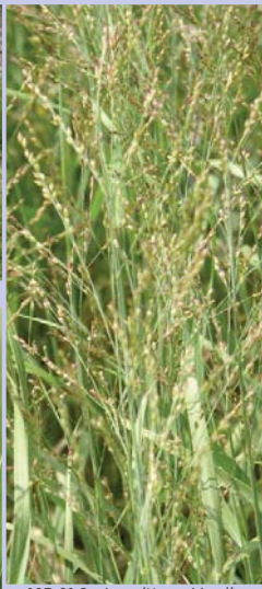
097-60 Panicum 'Heavy Metal'