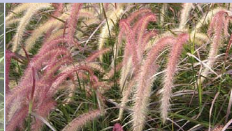
097-75 Pennisetum setaceum 'Rubrum'