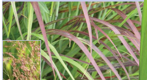
097-62 Panicum 'Shenandoah'