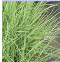
097-89 Schizachyrium 'Prairie Blues'