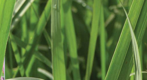
097-65 Panicum 'Thundercloud'